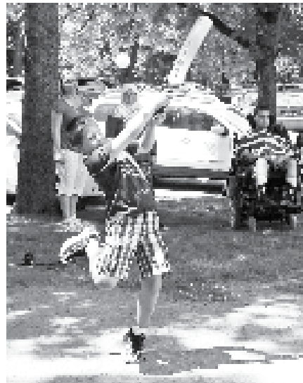
A game of cricket brings together Muslim and Christian participants in Taking Heart.

These hours spent together bear fruit in the form of action — action to change our world for the better. Not only is building relationships at the core of our mission, but it is also extremely powerful.